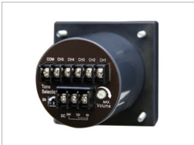
Terminal box for power and sound (back side)