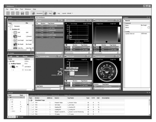
< DAQMaster screen >

XVisit our website (www.autonics.com) to download the user manual and software