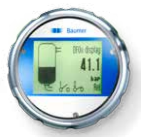
Tank visual (tank/bottle)