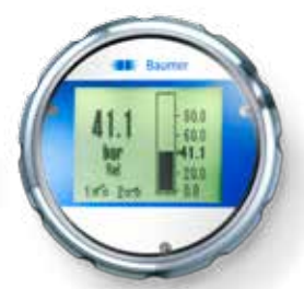
Bar graph (vertical/horizontal)