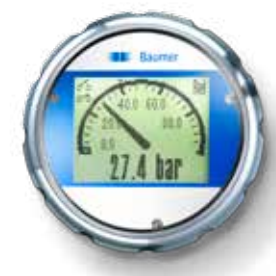
Analog (with/without value)