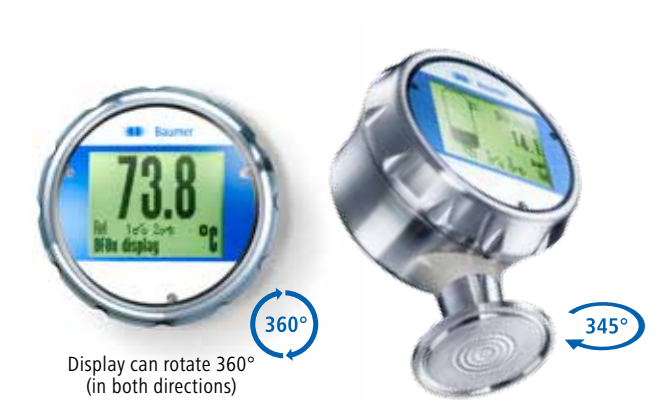
Connection can rotate 345°. (bottom connection only)

You can even program the specific messages that you want to be displayed.