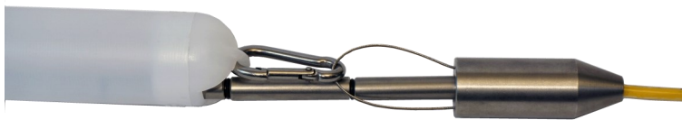
Removable hook for bailer (the probe can be inserted in the sampler)